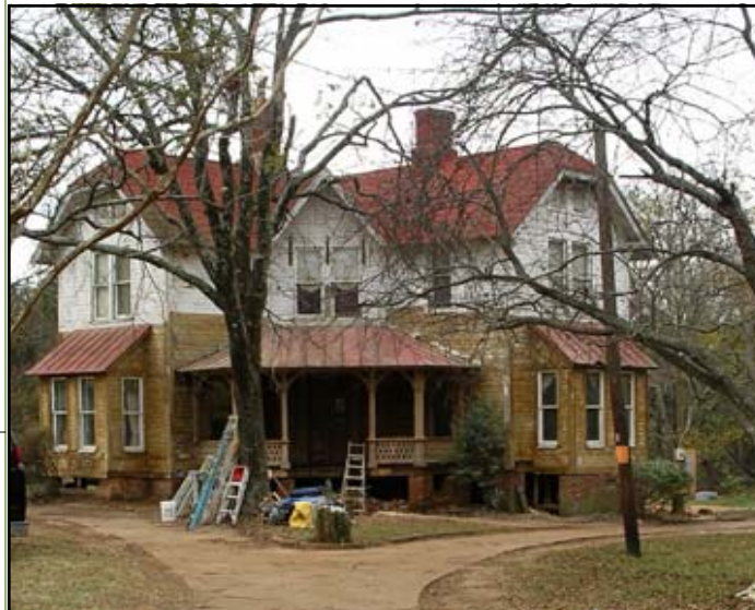
Mott House on Langtree Road, 1885

Revolutionary War battle at Torrence Tavern (1781).