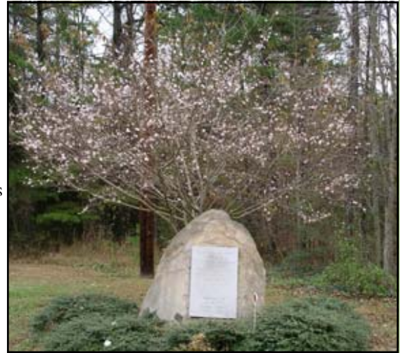
Crowfield Academy marker on Highway 115N, 2 miles north of Davidson College

The Mt. Mourne community developed around Centre Church, which was established in 1765, more than 70 years prior to the establishment of Davidson College. In fact, General William Lee Davidson, for whom Davidson College is named, was reared and resided in the Centre congregation. Among the many historical sites in this community, there